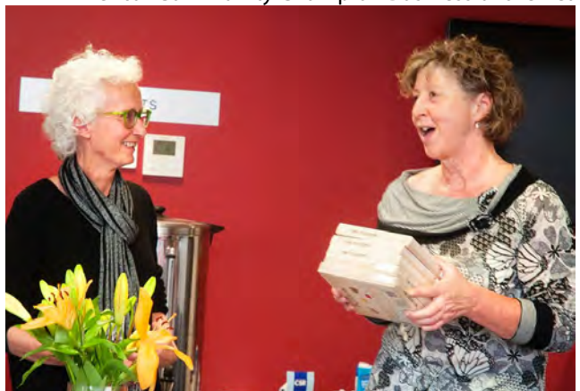
Kaniva College – MATES Mentoring Team of the Year