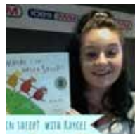
Where is the Green Sheep https://youtu.be/33YBlieBtBs