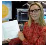
Koala Bare https://youtu.be/kV-mMvCeK5c