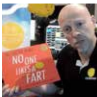
No One Likes a Fart https://youtu.be/sygRqfex1os