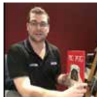
Pig the Pug https://youtu.be/rHFRpLHCW3I