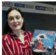
Arty Farty Marty https://youtu.be/kvr7iSxm4c8