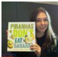
Piranhas Don't Eat Bananas https://youtu.be/ukmUMB3g9fQ