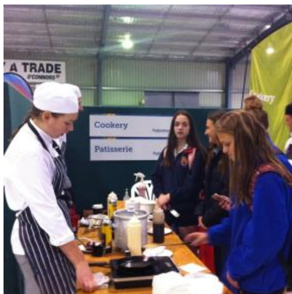
Federation University Cookery and Patisserie try-a trade exhibit

Collingwood's Moana Hope, was a guest at his year's Expo and conducted two seminars where she told her story and answered questions.