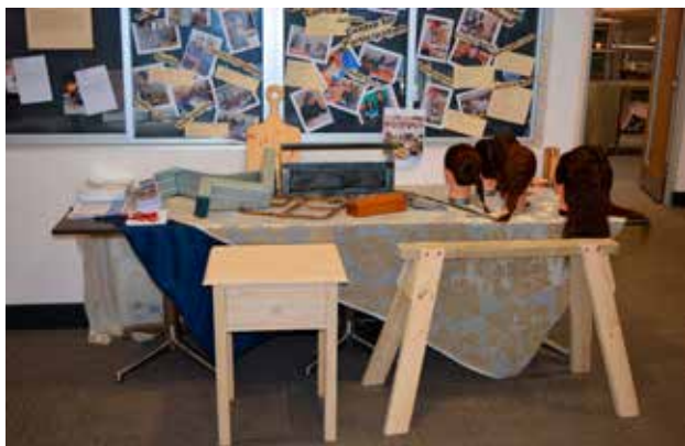
Pictured: Work, photos and stories of current VET students on display at the VET & SWL Business Luncheon.

The WSMLLEN held a Business Luncheon on Wednesday 5 June at the Wimmera Trade Training Centre restaurant. The students studying Certificate II in Kitchen Operations catered for the lunch. It was a four course meal with canapés and iced tea to start. The students were very professional in their approach and suitably impressed the guests with the delicious food they prepared and served. A display of work completed by students in other courses was available for the guests to peruse at their leisure along with a promotional video produced by the Screen and Media students. A number of articles about the experiences of students at their VET courses were also available to read. Guest speaker Shannon Morrow from Morrow Motors spoke about the students they have hosted over the years and the range of skills the students who are studying VET Automotive bring to their business. Shannon highlighted the fact that these students are 'work ready' because they have begun their training and skill development through their VET course.